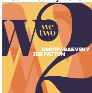
We Two Jazz&People 2018