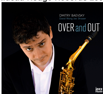
Over and Out Jazz Family 2015