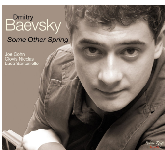
Some Other Spring Rideau Rouge Records 2009