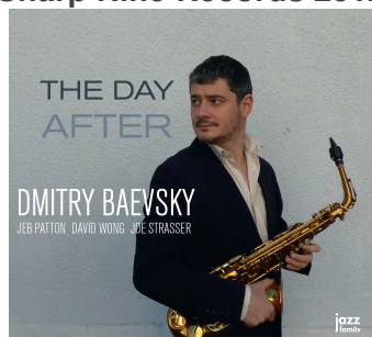
The Day After Jazz Family 2017