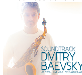
Soundtrack Fresh Sound New Talent 2021