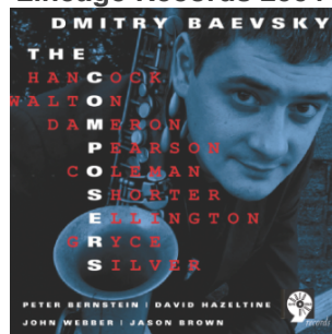
The Composers Sharp Nine Records 2012